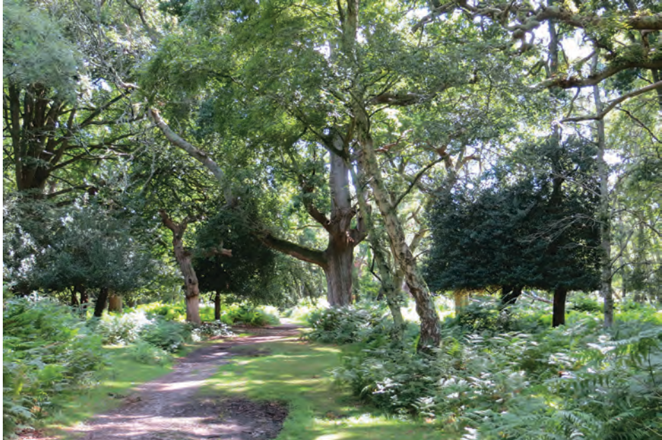
Figure 3. Woodland showing animals' browsing line under holly trees

areas; and bracken, moss, cotton grass and willow on the boggy ground. The area of Brockenhurst village, for example, is only 16 metres above sea level. During winters the land in such areas typically is perpetually wet, partly relieved on exceptionally cold days when the ground surface freezes. Even then, centigrade temperatures reach only a few degrees below zero. A distinctive feature of the open Forest is a tendency for shallow rain water pools to form, of varying size and some almost permanent.