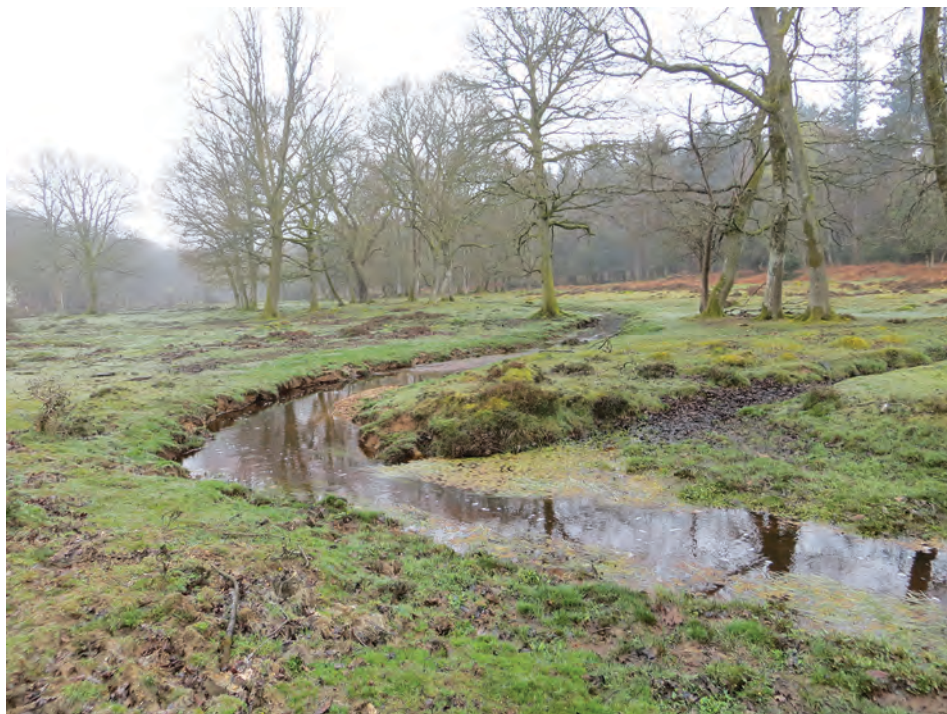
Figure 2. A typical New Forest watercourse

Forest area was a shallow sea or large river estuary. The landscape is punctuated by a number of sand and gravel pits, both disused and active.