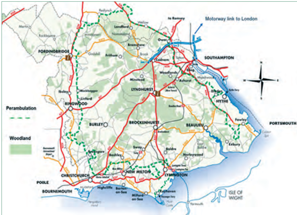
Figure 1. Main features, villages and urban areas in and near the New Forest National Park