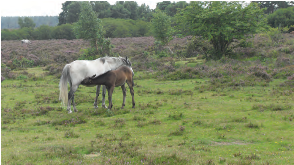
Figure 5. Indigenous free living New Forest ponies in their natural habitat

the unique New Forest cicada ( Cicadetta montana ) may be extinct. Commercial picking of fungi is illegal, but in 2017 it was necessary to launch a public awareness campaign to reinforce the message. People are required to limit themselves to small quantities taken strictly for personal consumption. Trends highlight that a growing scarcity of its most rare and precious natural assets is a major problem for the New Forest today. Wise (1895, Appendices II, III and IV) lists species present at the end of the nineteenth century which can be compared with twentieth century data for bird, flowering plant, butterfly and moth populations.