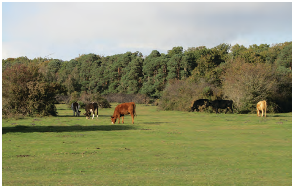
Figure 4. Cattle graze a lawn, conifer plantation inclosure in the background

gorse, bracken and heather dominate in varying proportions, interspersed with grass areas (lawns) favoured by cattle and the indigenous New Forest ponies for their grazing, all set against the backdrop of inclosures of commercial pine and deciduous trees (Figure 4).