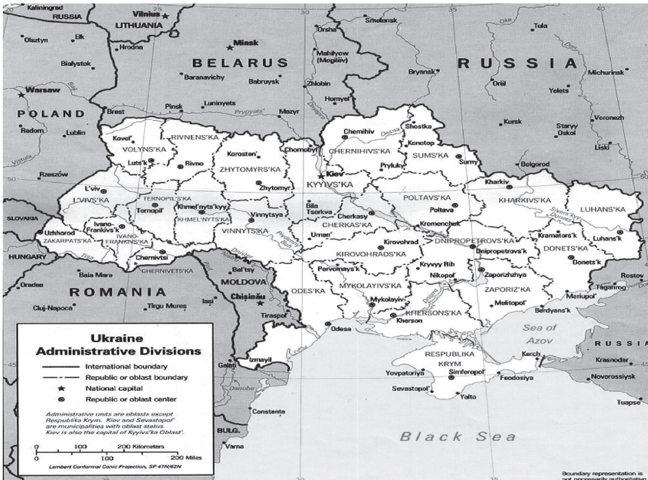
FIGURE 2. Regional map of Ukraine. RYSUNEK 2. Mapa administracyjna Ukrainy.